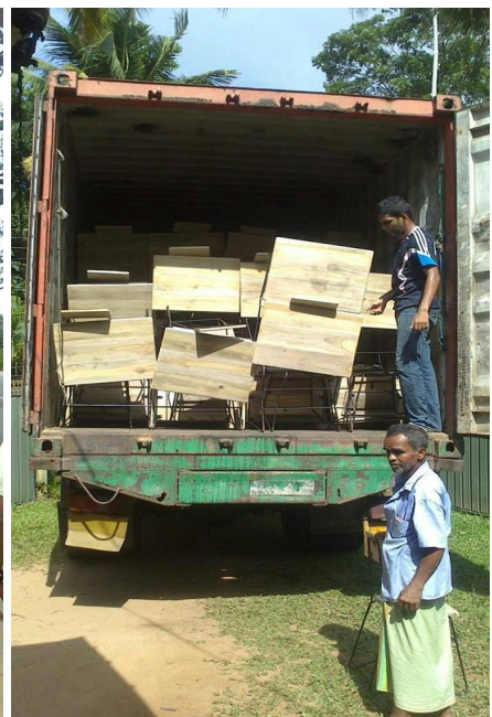
One more child goes to school-project (Sri Lanka). Our donation has contributed to equip school with furniture.(see att.2)